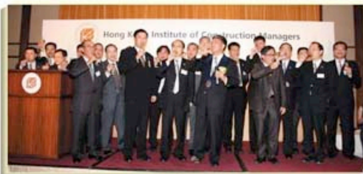
HKICM Council Members and Hon. Presidents toasting to all guests