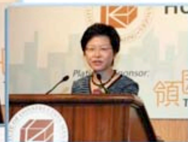
Speech by Guest of Honor, Mrs. Carrie Lam JP, Secretary for Development