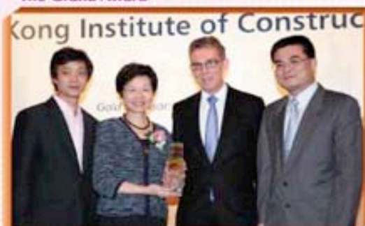
Mrs Carrie Lam presenting award to The Link Management Ltd.