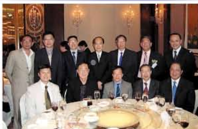
Group photo of HKICM Council members in the QBA 2008 Award Banquet

The QBA Award 2008 Conferences held in Chiang Shen Studio Theatre, The Hong Kong Polytechnic University on Jun, 27 & 28 th , 2008; together with the QBA 2008 Award Presentation Banquet at Island Shangri-la hotel on Jul, 4, 2008 which drew the highest attendance from the outsiders more than 400 people attend the Award Presentation Banquet since its launch in QBA 2001.