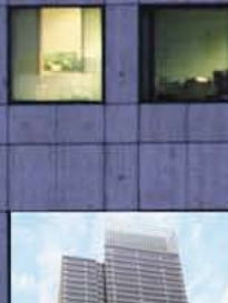
宏泰道 One Kowloon