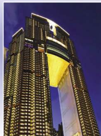
The Arch 凱旋門