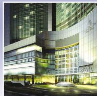
Four Seasons Hotel and Four Seasons Place 四季酒店及四季晉