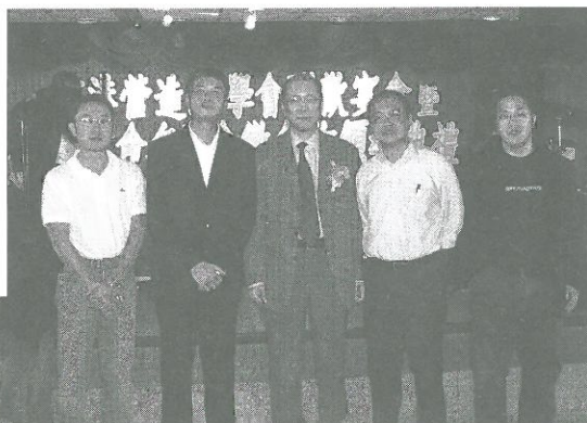
Members of the JO Committee