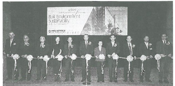
Gone the ribbon came the Symposia