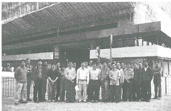
Site visit at Sai Wan Ho